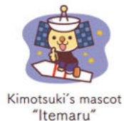
Kimotsuki's mascot "Itemaru"